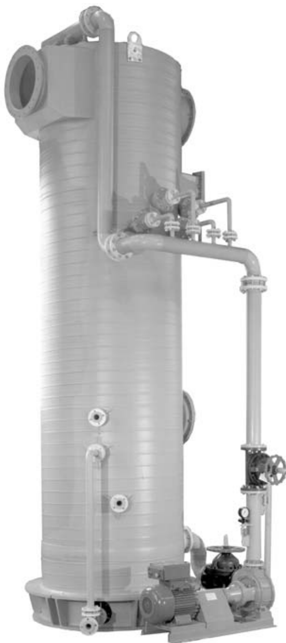
Fig. 1 Jet Scrubber Type II DN 600 from polypropylene (PP)

Jet scrubber type II represents a constructional variation to the traditional jet scrubber. The scrubber tube is integrated in the separator tank and has an elliptical cross section. The size of the cross section can be freely selected. The elliptical shape is particularly advantageous when the nominal width of the unit is large because, in contrast to the circular cross section, the depth to which the gas penetrates through the liquid flow is considerably reduced. The height of the chamber